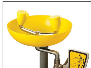
Speakman SE-495 with AXION Advantage eye/face wash head