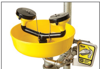
Encon 01050216 with AXION Advantage eye/face wash head