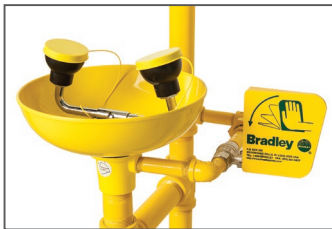
Bradley S19-310FW with AXION Advantage eye/face wash head