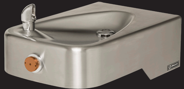
1107L w/PBA6C button kit